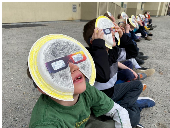
Student watching the eclipse at LPES.

https://www.rminternational.ca/homestay2/homestay-referral-program .