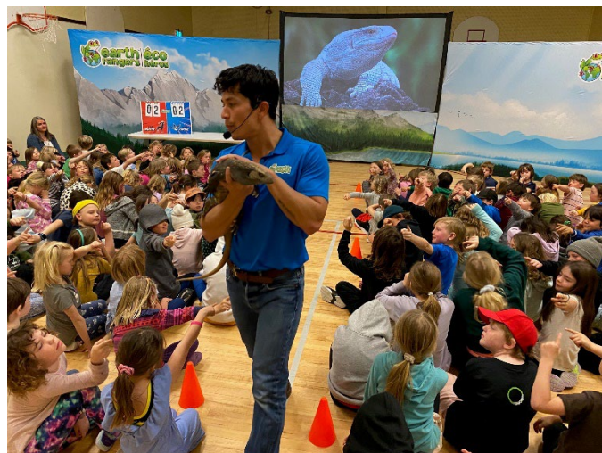
Earth Rangers Presentation at LPES

For those who are planning ahead, please review the 2024-25 Distict Calendar .