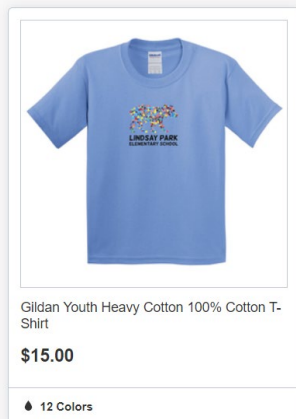
Gildan Youth Heavy Cotton 100% Cotton T-Shirt